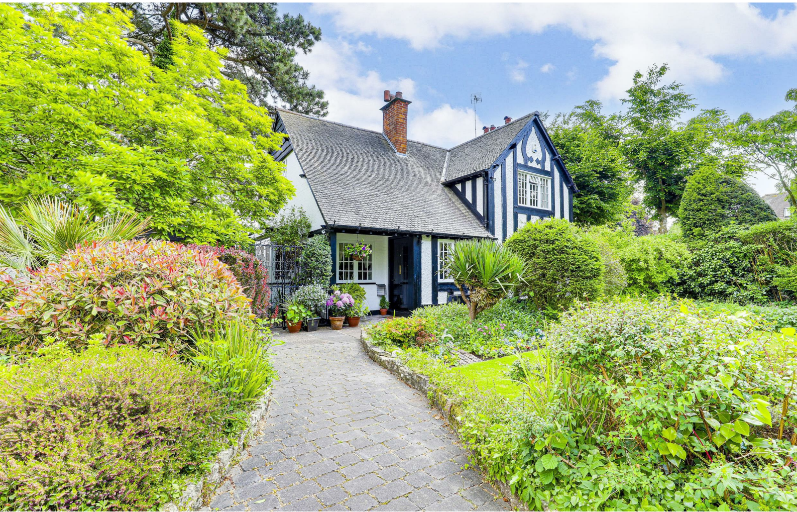
Old Melton Road, Normanton on the Wolds, Nottinghamshire NG12 5NN